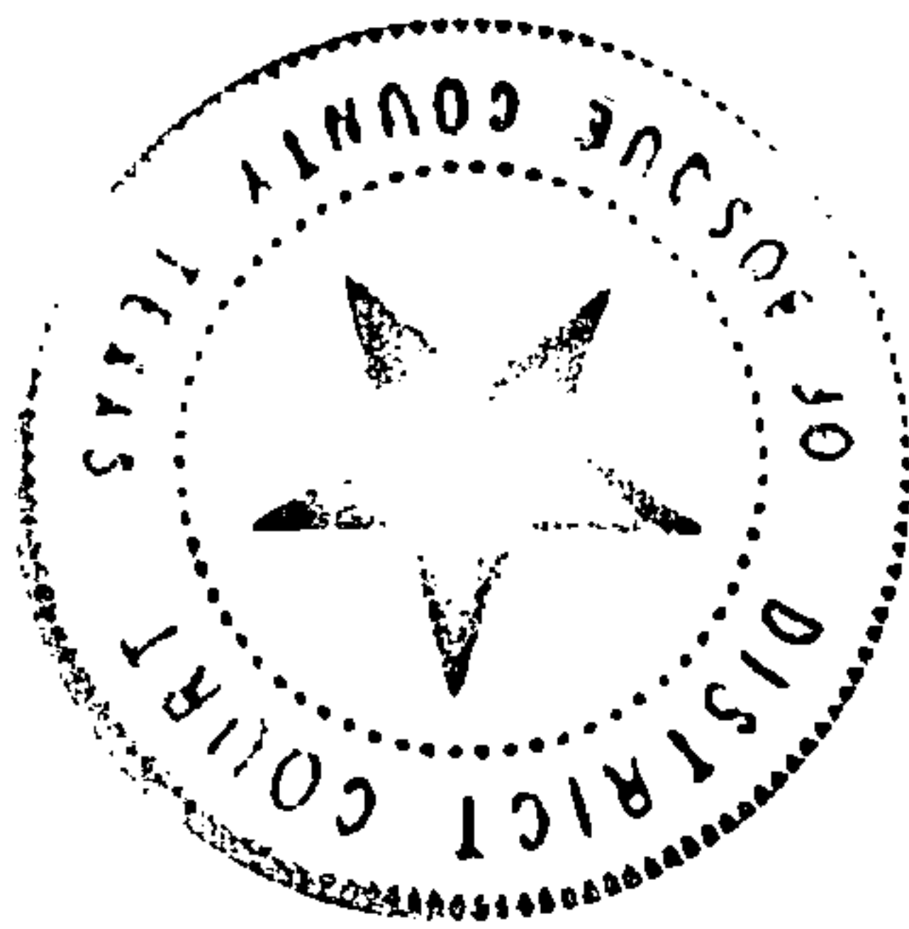
Clerk of the District Court Bosque County, Texas 220th Judicial District

Issued but not prepared by District Clerk's Office and given under my hand and seal of said court in the City of Meridian, Bosque County, Texas, this the 12 th day of December , 2024. 2023